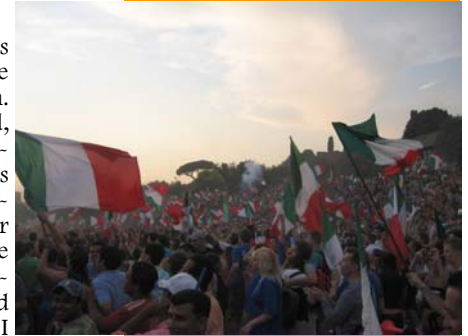
Crowd celebrating in Rome after the Italian soccer team won the 2006 World Cup.

tors to gather at Circus Maximus and cheer the Italian National team. Surrounded by red, white, and green I succumbed to the infectious roars. Lesson #3 in cultural immersion: root for the home team. The second it was determined that Italy had won the World Cup, I thought for sure Rome would catch afire. What was I doing here? Why did I put myself in this extremely volatile situation? After five hours of continual singing and non-stop jubilation, it occurred to me; this was a once-in-a-lifetime opportunity. Go Italia!