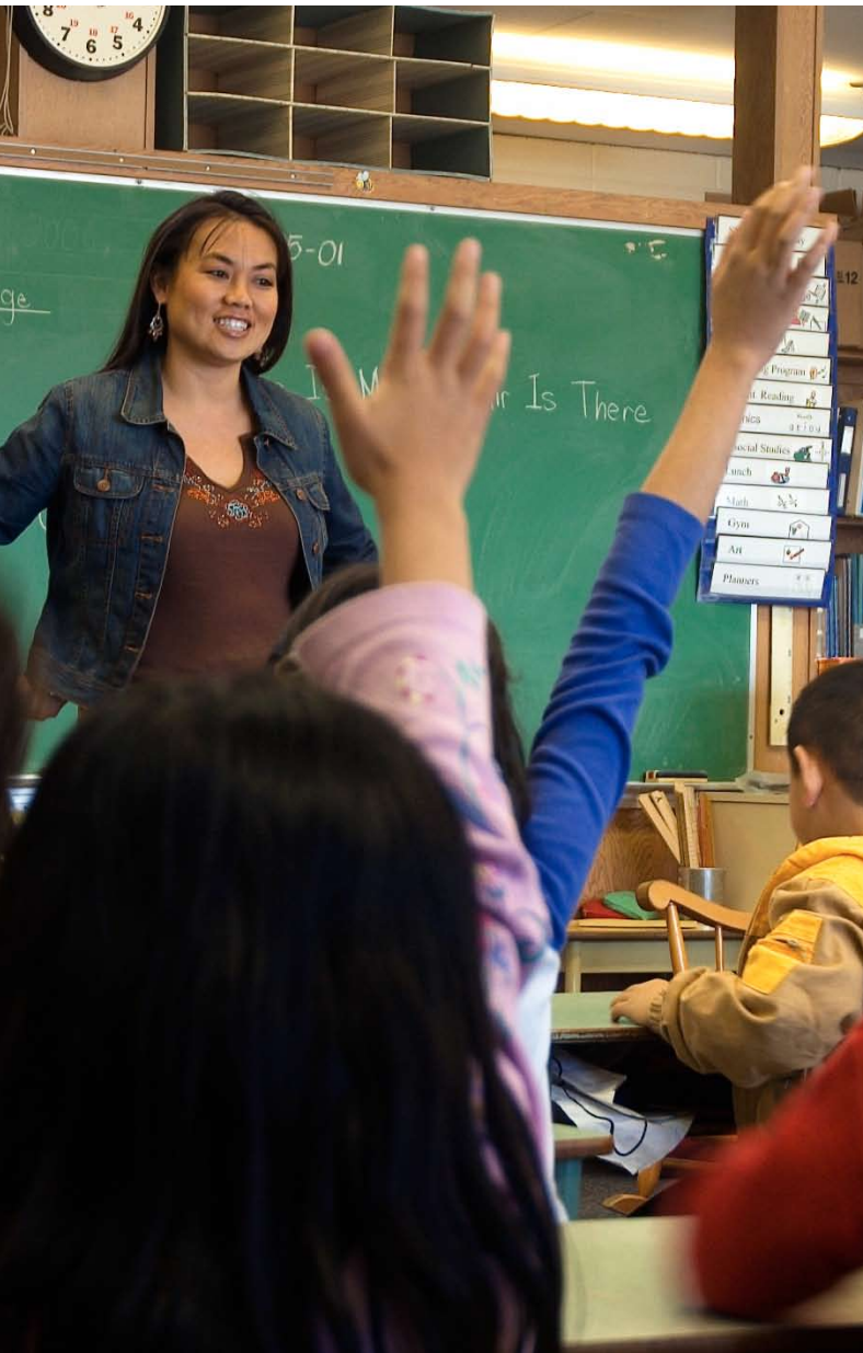
WIDE-EYED PUPILS • Students throughout Chicago enjoy hands-on learning from fresh-thinking instructors.