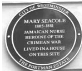
New-style “Green Marker” in London