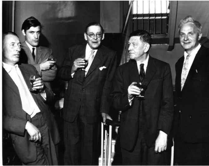
MacNeice, Hughes, TSE, Auden, Spender

The exhibition closes with a section on Ted Hughes—Eliot’s last major discovery as a publisher—whose Hawk in the Rain was published by Faber in 1957. Items here include two journal entries by Hughes, part of the Hughes archive acquired by the British Library last year. In the first entry, Hughes recounts attending a cocktail party given by his publisher in June 1960 and describes his impressions of fellow Faber poets Auden, MacNeice and Spender. The news of