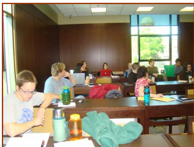
Ph. D students at the Klarcheck Information Commons discuss their work together at the Dissertation Boot Camp held this spring.

Our students made great use of their time and demonstrated huge leaps in progress on their proposal and/or final chapters of the dissertation. One of our participants has already defended her dissertation later this past summer and has moved on to start a new job. The Graduate School will continue to meet with these students periodically and monitor their progress.