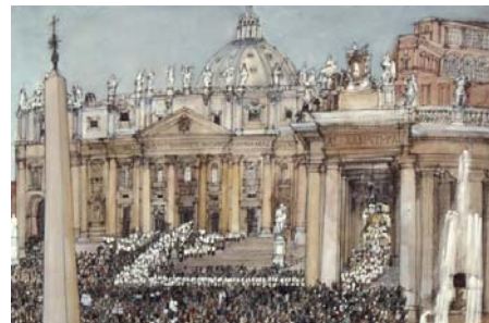
Vatican Council II: Opening Procession, Franklin McMahon

Tuesday, September 29, 6:00 pm., Free RSVP Susann Ozuk sozuk@luc.edu 1(800) 424.1238 at LUMA*