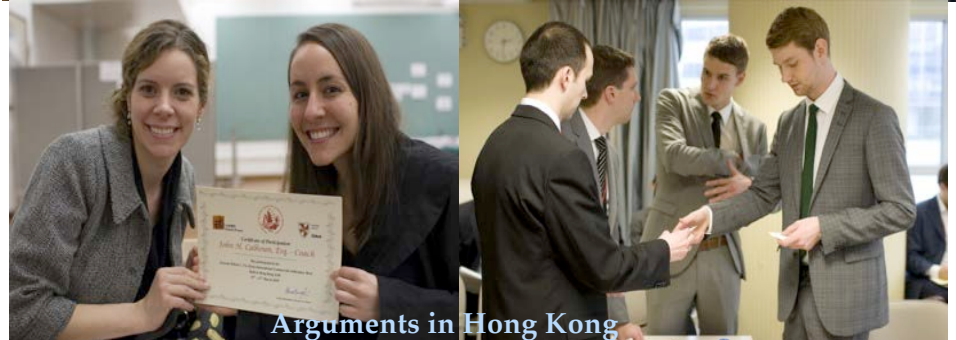
Arguments in Hong Kong