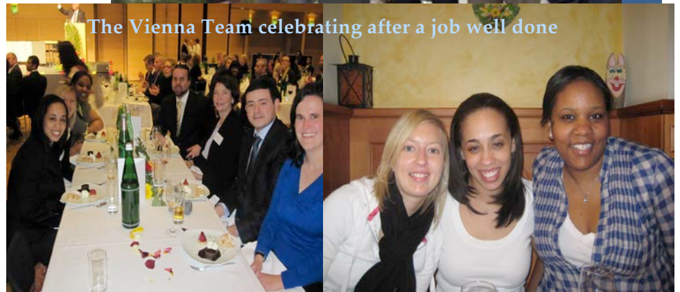
The Vienna Team celebrating after a job well done