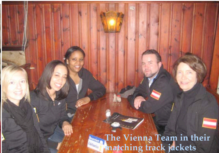
The Vienna Team in their matching track jackets