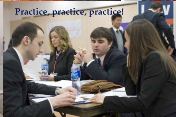
Practice, practice, practice!