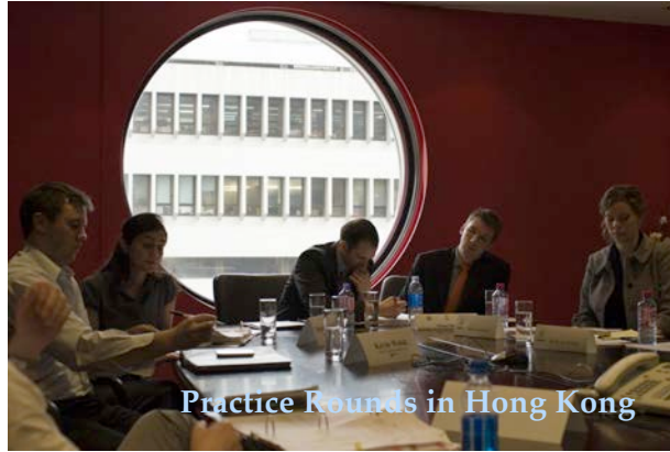
Practice Rounds in Hong Kong

The second benefit from the pre-moot was getting to meet with and hear arguments from other teams. Since the Fordham pre-moot was approximately halfway through the practice period, our team had grown concerned that it was only practicing with itself and occasionally Loyola's Vienna team. Heading to New