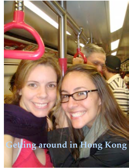
Getting around in Hong Kong

It was incredible to interact with an international crowd of students, arbitrators and young professionals in such a modern Asian city. Overall this trip was as much an experience in international relations as it was a competition about international law and arbitration.