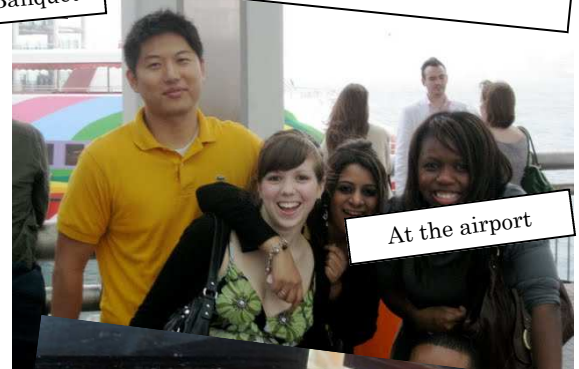
At the airport