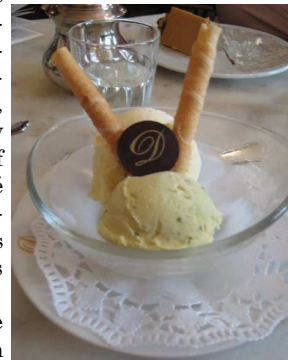
Ice Cream at Café Demel

The combination of mooting, meeting new people, seeing the sites, and trying delicious Viennese and French cuisine, made this an unforgettable experience!