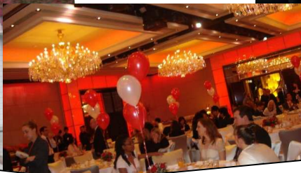
All decked out for the Final Banquet