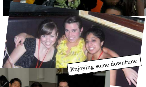
Enjoying some downtime