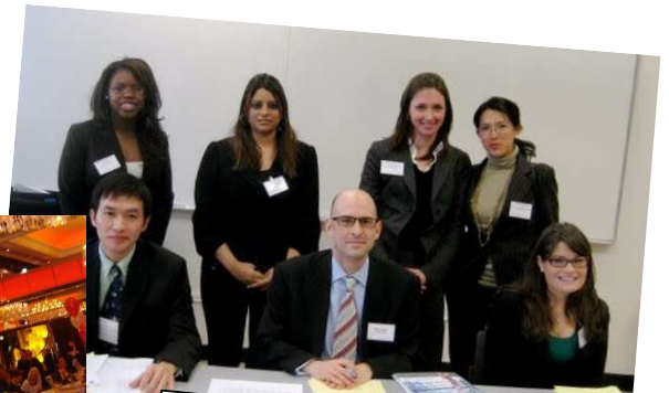
Competitors and arbitrators after a preliminary round