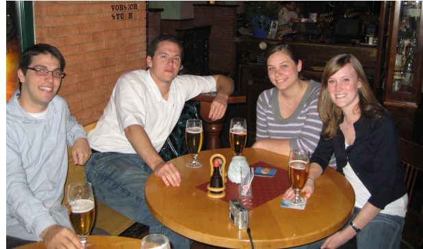
The team relaxing in Vienna after a long day of mooting