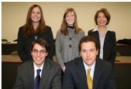
The Vienna Team