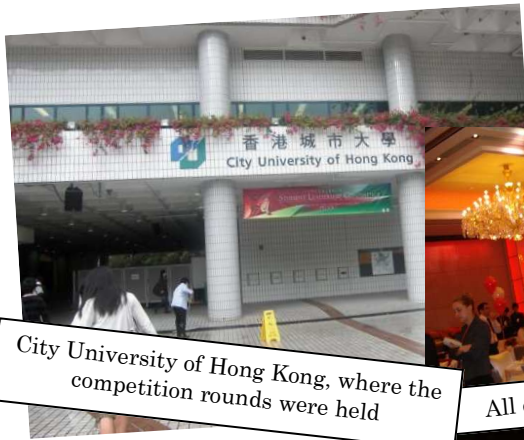
City University of Hong Kong, where the competition rounds were held