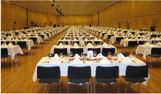
Room set for 233 teams for the Final Argument in Vienna