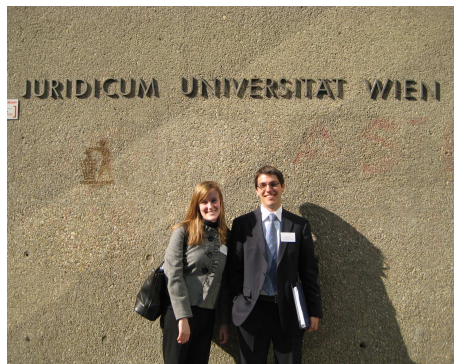
Vienna University, where most of the competition rounds were held

We arrived in Paris a little over a week before the Vis Moot began. Our time in Paris consisted of two very full days of practice rounds at the International Chamber of Commerce (ICC). Fortunately for us, the ICC is located in the heart of the city within walking distance of the Eiffel Tower. We took full advantage of this location, taking a