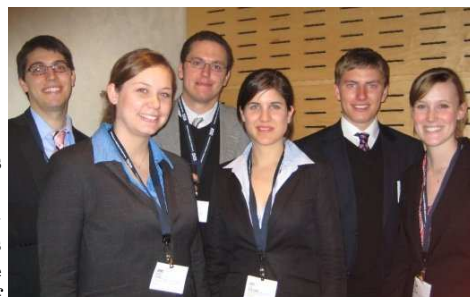
The Vienna Team pauses for a picture with fellow competitors at the ICC Pre-Moot in Paris

With over two hundred teams participating in the Moot, it could have been overwhelming to arrive without knowing anybody beyond the members of our