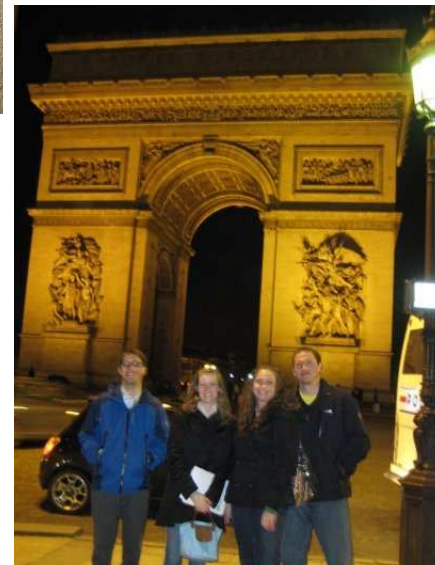
In front of the Arch de Triumf in Paris