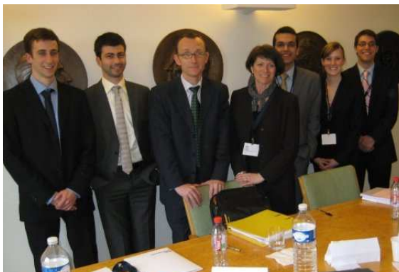
Competitors and arbitrators at the ICC Pre Moot

This year, the Vienna Vis Moot team was fortunate enough to be invited to the International Chamber of Commerce's Pre Moot in Paris, France. The Pre Moot consisted of sixteen teams from all over the world, many of