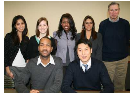
The Hong Kong Team