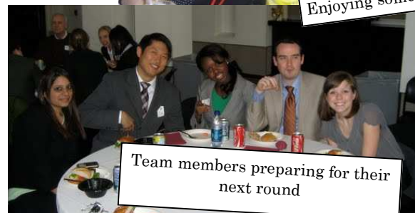
Team members preparing for their next round