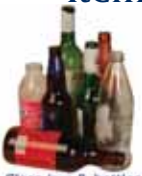
Glass jars & bottles