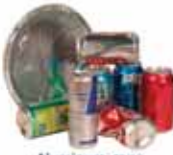
Aluminum cans, foil & pie tins