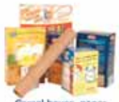
Cereal boxes, paper towel rolls, etc