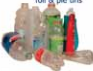
Plastic bottles & containers (#'s 1-5 and 7)