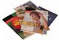
Magazines & catalogs