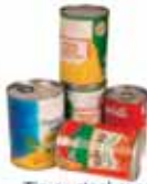
Tin or steel cans