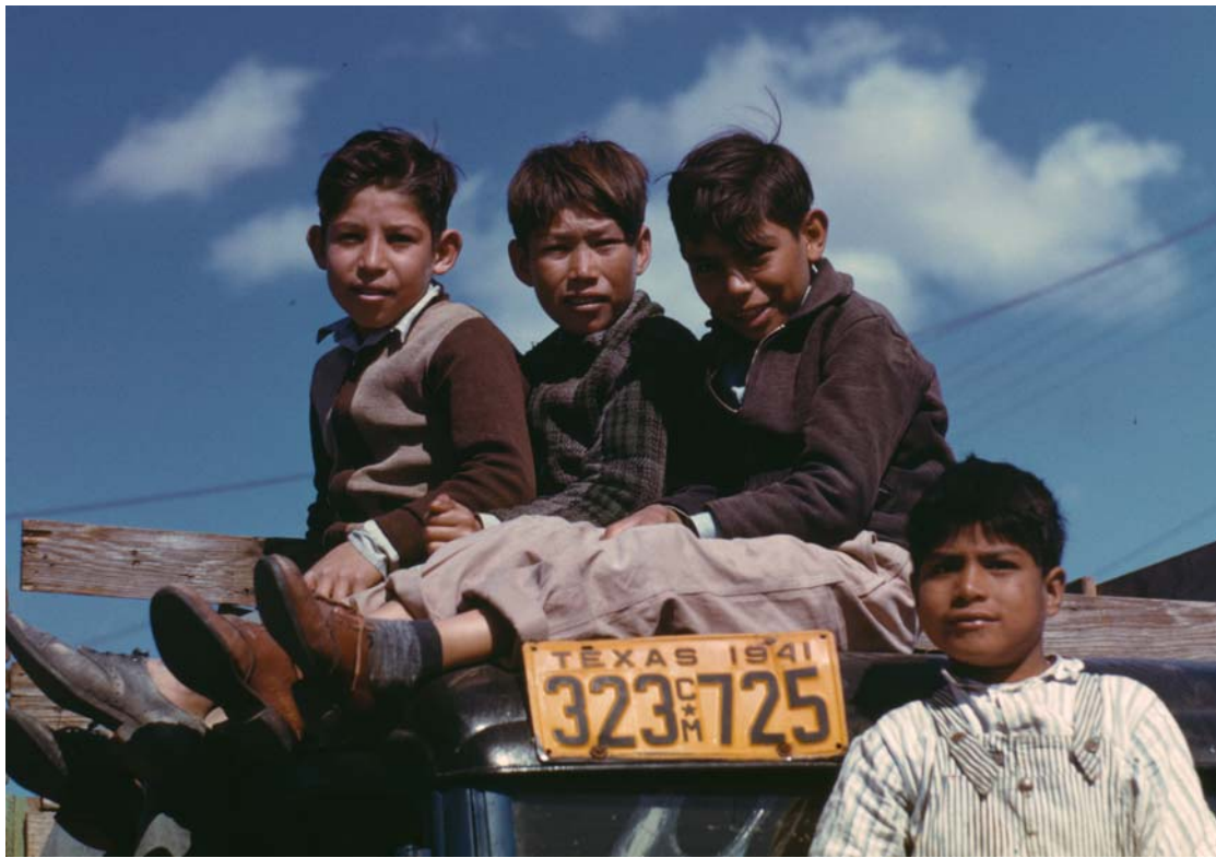
Boys sitting on truck parked at the FSA ... labor camp, Robston, Tex. 1942 http://hdl.loc.gov/loc.pnp/fsac.1a34264

On the fourteenth day of April of nineteen thirty five, There struck the worst of dust storms that ever filled the sky: You could see that dust storm coming, the cloud looked deathlike black, And through our mighty nation, it left a dreadful track... This storm took place at sundown and lasted through the night, When we looked out this morning we saw a terrible sight: We saw outside our windows where wheat fields they had grown Was now a rippling ocean of dust the wind had blown. It covered up our fences, it covered up our barns, It covered up our tractors in this wild and windy storm. We loaded our jalopies and piled our families in, We rattled down the highway to never come back again. (Woody Guthrie, from "Dust Storm Disaster")