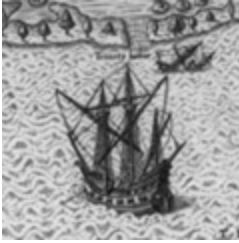
Bry, Theodor de. "[Englishmen's Arrival in Virginia.]" Print. [1590.]