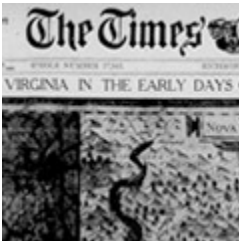
Richmond Times Dispatch. April 27, 1907.