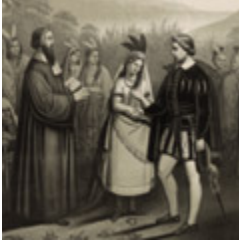
Spohni, George. "The Wedding of Pocahontas with John Rolfe." Lithograph. Philadelphia: Joseph Hoover, c1867. From Library of Congress Prints and Photographs Online Catalog. http://hdl.loc.gov/loc.pnp/cph.3a08570