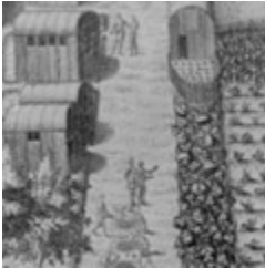
Bry, Theodor de. "[Village of Secotan.]" Print. [1590.]