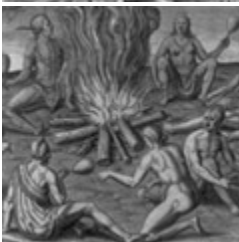
Bry, Theodor de. "[Praying Around the Fire with Rattles.]" Print. [1590.]