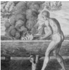
Bry, Theodor de. "[How They Build Boats.]" Print. [1590.] From Library of Congress Prints & Photographs Online Catalog. http://hdl.loc.gov/loc.pnp/cph.3b00422