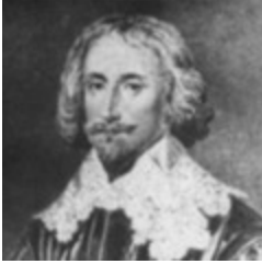
"[Virginia 1606]." May 28, 1904. Photo. From Library of Congress Prints and Photographs Online Catalog. http://hdl.loc.gov/loc.pnp/cph.3a43109