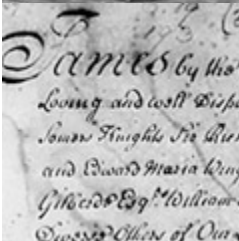
"Charter for the Virginia Company of London, 1606." 1606.