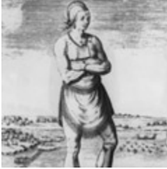
Bry, Theodor de. "[A Chief of Roanoke.]" Print. [1590.]