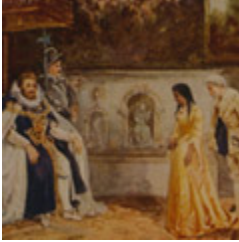
Rummels, Richard. "Pocahontas at the Court of King James." Print. NY: American Colortype Co., 1907.