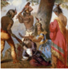
"Powhatan brand." Lithograph. NY: Sarony, Major & Knapp, 1860. From Library of Congress Prints and Photographs Online Catalog. http://hdl.loc.gov/loc.pnp/cph.3b52560