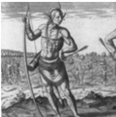
Bry, Theodor de. "[A Weroans, or Chieftain, of Virginia.]" Print. [1590.]