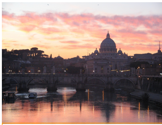
One view Ricci Scholars can get used to: from the Umberto Bridge at the Rome Center.

The Ricci Scholarship is a great honor for students who wish to continue in the cross cultural Jesuit education. The Biology