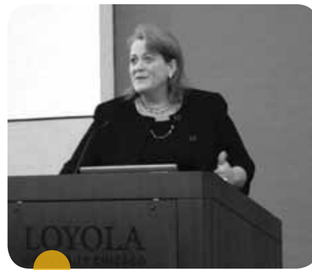
Honorable Virginia Kendall Judge, Northern District of Illinois

> Amend the Juvenile Justice and Delinquency Prevention Act to include the following provision: