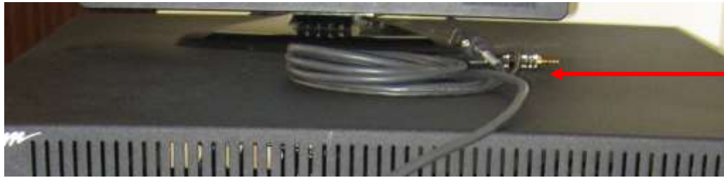
Laptop Cable Inputs