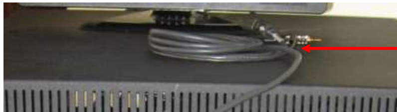
Laptop Cable Inputs