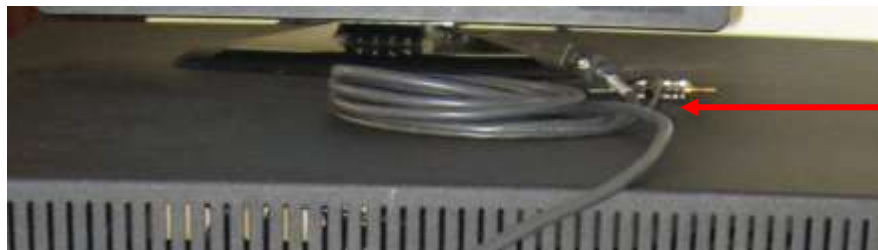
Laptop Cable Inputs