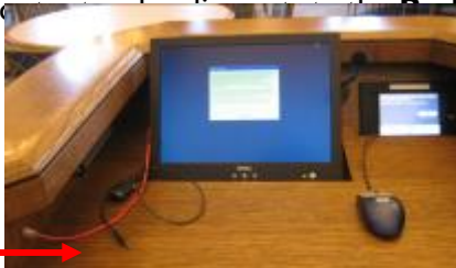
Podium Laptop Cables