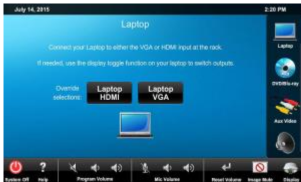
↑ System Off

Using the Touch Panel, press the System Off button, and then press Shutdown .