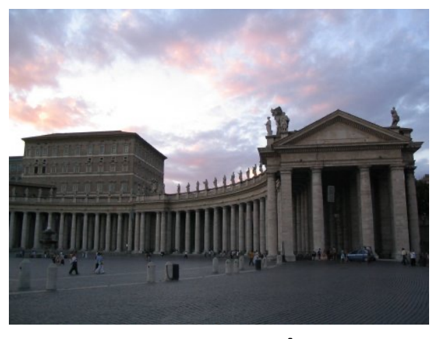
St. Peter's Square/Basilica