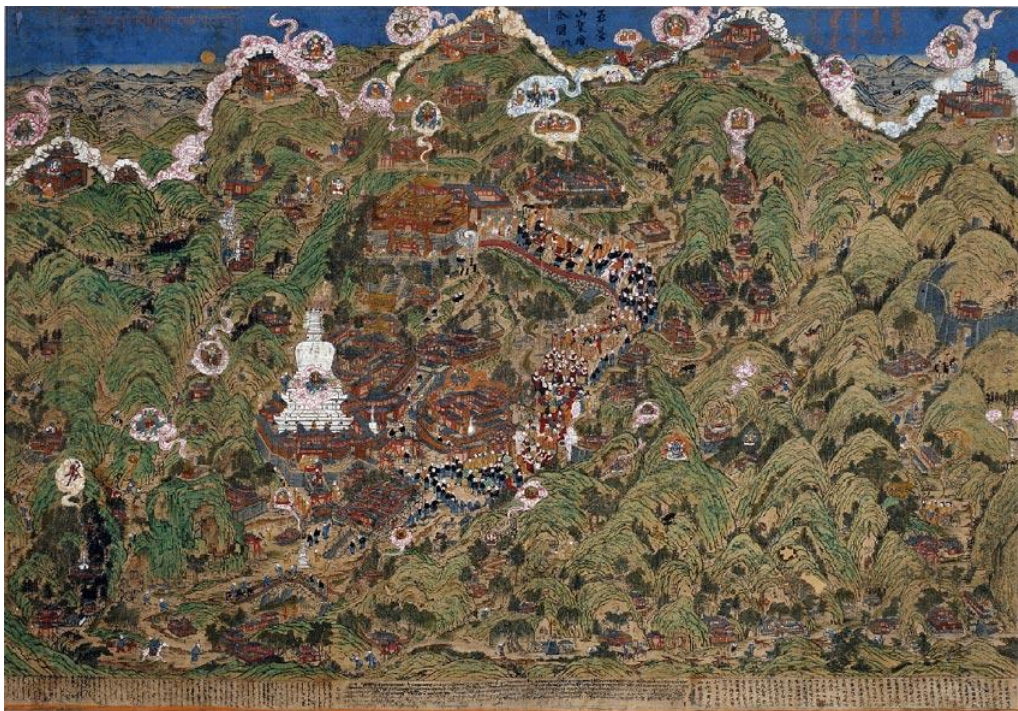
Map of Wutaishan, 1846, Sino-Tibetan, painted and colored xylograph, Rubin Museum of Art