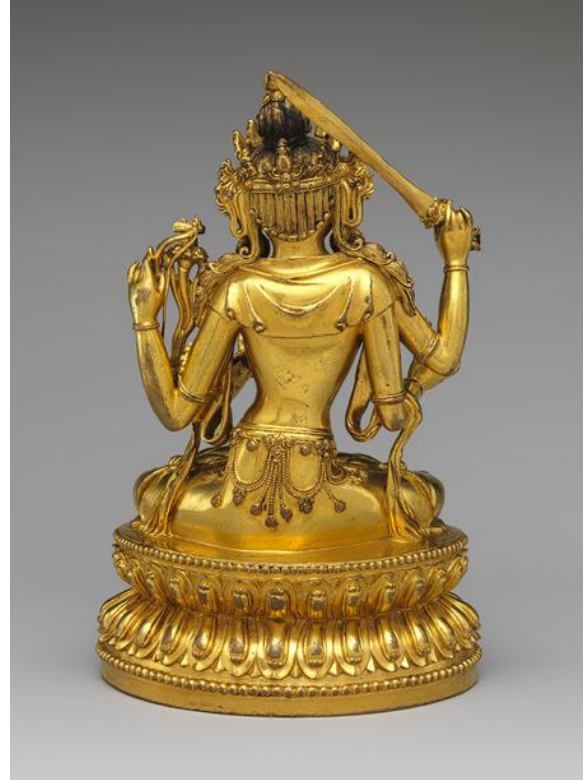
Bodhisattva of Wisdom (Tikshna-Manjushri) , 1403-24