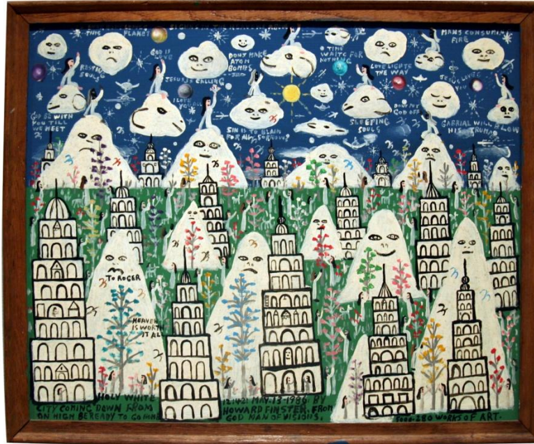
Howard Finster, Holy White City Coming Down #5000.280 , 1996. Enamel on wood, 15 7/8 x 20 1/8 in., Collection of Roger Manley.