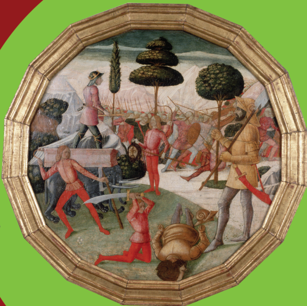
Desco da Parto, Florence, Italy, ca. 1440