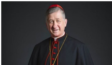
Cardinal Blase Cupich

The Hank Center for the Catholic Intellectual Heritage, in collaboration with the Loyola University Jesuit Community, sponsors its inaugural Cardinal Bernadin Common Cause lecture this April 18. The lecture offers a Catholic prelate each year a platform to engage Loyola's community in common cause with the Church on issues facing us today.