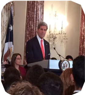
John Kerry, Secretary of State