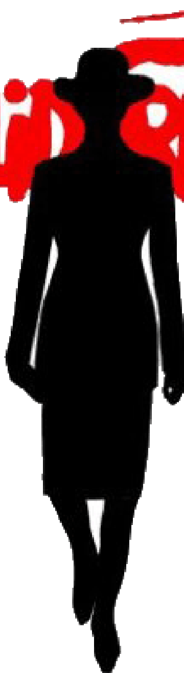
this image is a feminist artistic response, by Slovenian artist Sonya Ivekovi, to the High Noon election poster used by Solidarity in the 1989 election campaign.