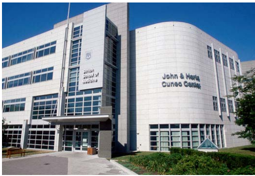
Stritch School of Medicine